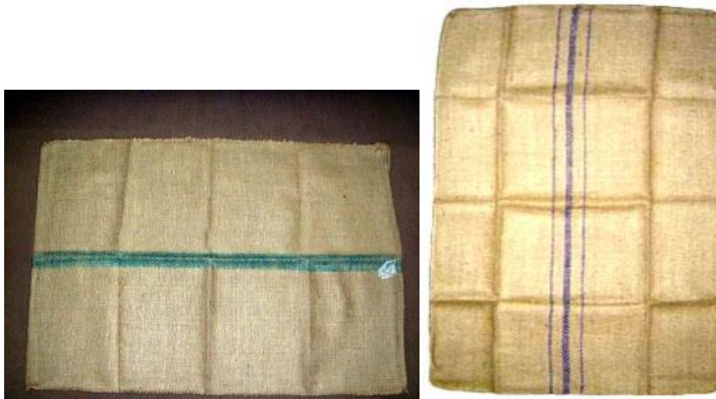
Plate 1: Samples of Jute bags used for packing agro products

in Nigeria (Ogazi et al., 1997). Likewise, a number of research institutes in the country have carried out research on kenaf processing facilities in Nigeria. Examples of these include the fabrication of small (farmer friendly) and pilot scale kenaf decorticating machines. The initiation and expansion in production of kenaf processing facilities in Nigeria will promote skill acquisition and technological development of jute sacks industry locally (RMRDC, 2007). According to Aribisala (1993), Ogunwusi (2003) and RMRDC (2009), the development of a virile kenaf industry in Nigeria will promote higher net returns for commodities exporters, improve local competence in kenaf growing and processing, as well as saving the nation up to $25 million annually in foreign exchange equivalent.