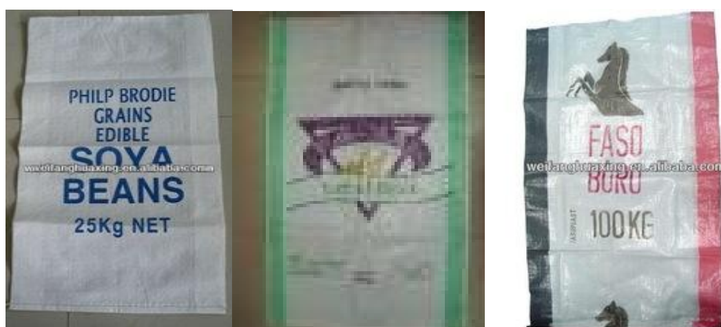
Plate 2: Samples of synthetic (polypropylene) woven bags