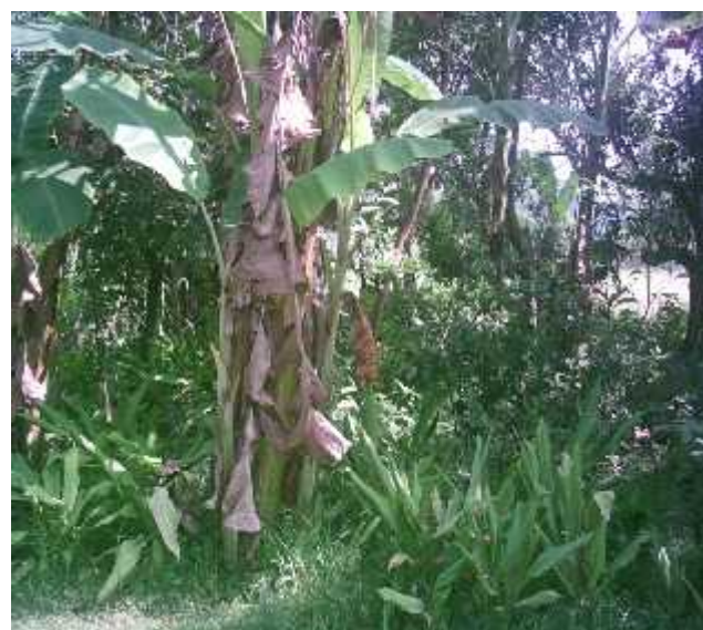
Figure 2. Homestead agroforestry in the study area (Capasia village)

The vertical canopy structure in the study site consists of a lower, intermediate and upper layer. The lower layer can usually be partitioned into two sub-layers, with the lowermost (less than 1 m height) dominated by different vegetable, herbs and medicinal plants, and the second layer (1-3 m height) being composed of food plants such as cassava, banana, papaya and yam. The intermediate layer of 3-10 m height is dominated by various fruit trees, some of which would continue to grow taller. The upper tree layer can